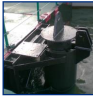
PILE GUIDES AND PILES