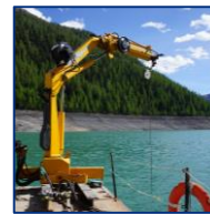
CRANE WITH MOUNTING FRAME